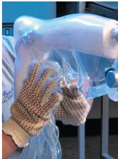
Our Orthotic Fabrication Services include everything from thermoplastic AFOs to the Free Walk® Stance-Control KAFO.

Expertise in fabrication technologies is a given. But we stand apart by continually evaluating new materials and improving our processes, building in quality checks and documentation throughout production to ensure that you get your job your way.