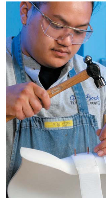
The Body Jacket by Measurement spinal jacket offers custom details with fast delivery.

*The discount does not apply to the Free Walk® or to upper extremity prostheses. To receive discounts for the C-Leg® Otto Bock must fabricate the test socket and the definitive socket. The extended warranty offer does not include soft goods, sprays, cosmetic covers and fabrication services.