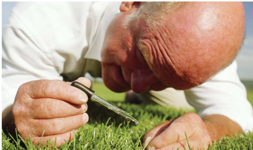
Even Mr. Control knows that Otto Bock checks all the details.

Prosthetic Fabrication in Minneapolis, Minnesota, USA 14800 28th Avenue, Suite 110 Minneapolis, MN 55447