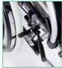
Wheel Lock Extension Handles