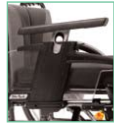
Height Adjustable Armrest