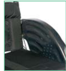
Side Panel with Neoprene Liner