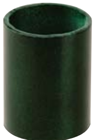
Sparkle Blue Green