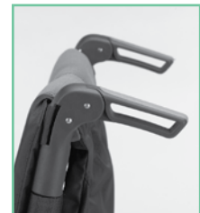
Flip Down Push Handles