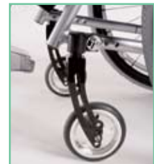
Caster Fork - Tall