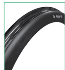
Natural Fit Super