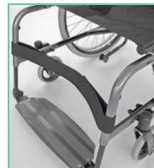
Continuous Footplate on Motus T