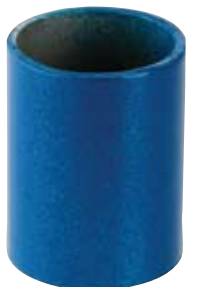
Dormant Marine Blue