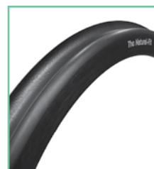
Natural Fit Standard