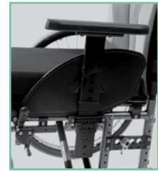
Plug-in "T" Style Armrest