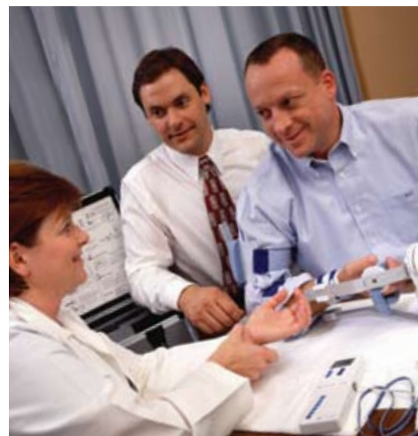
Post discharge, you can count on the entire OrthoRehab team to provide the therapies and services each patient needs for the best outcomes.

With a nationwide network of certified specialists, (including ABC training for orthotic fitting registration), you can depend on us for all of your specialty rehabilitation needs. We are passionate about getting patients back into motion!